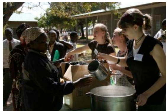
Some of the Wood-Bulls serving tea at tea time

P.S. In previous newsletters I have referred to www.10-happy-kidos.blogspot.com , which describes the daily activities of the ten Woodrow/Turnbull missionary kids, otherwise known as the Wood-Bulls. For better pictures of the conference and more entertaining comments from our volunteers' point of view, you may want to check it out.