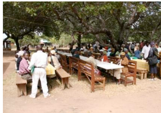
Mealtime at the conference